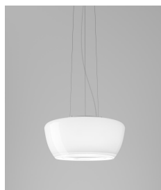
IMPLO SP 50