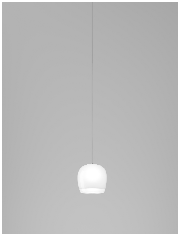
IMPLO SP 16 BCCR BC G9 CE